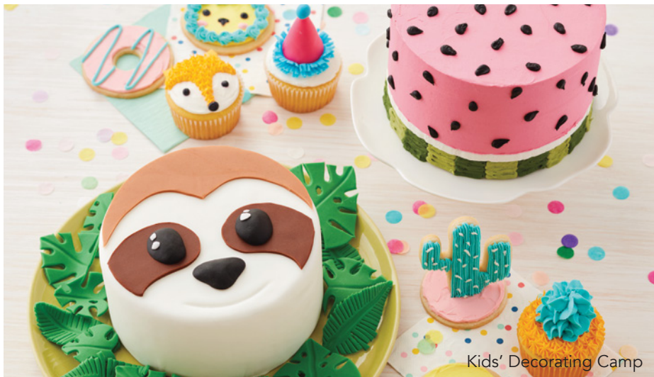
Kids' Decorating Camp

These Wilton classes are designed just for kids to introduce them to the awesome activities of baking and decorating. Along the way, kids learn lifelong culinary skills, express their creativity and have fun!