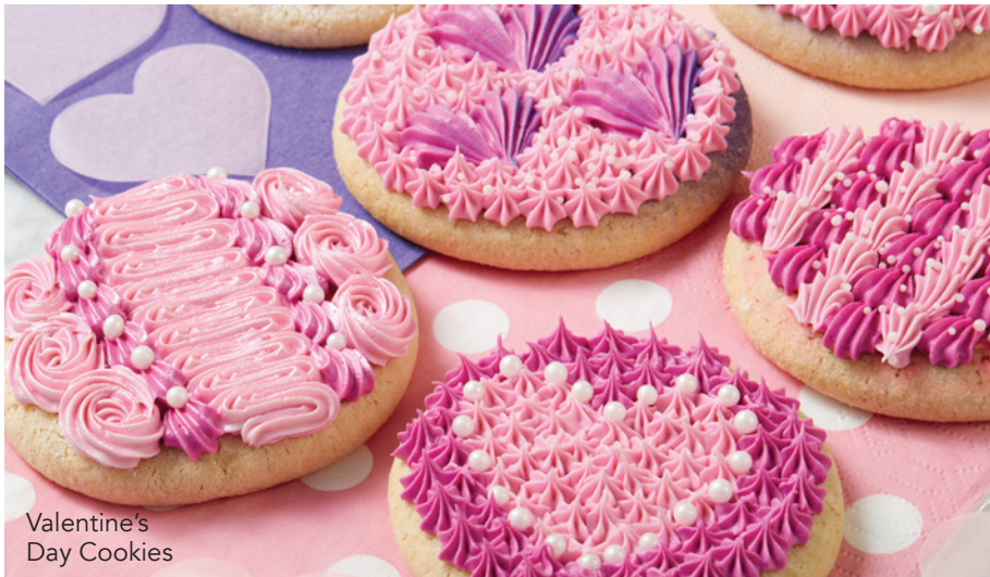
Valentine's Day Cookies

Spend time together learning how to decorate treats for a special occasion and that special someone. Families will have fun as they learn some new tricks for creating special treats.