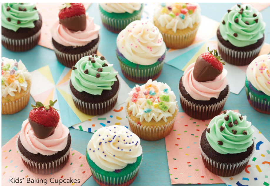
Kids' Baking Cupcakes