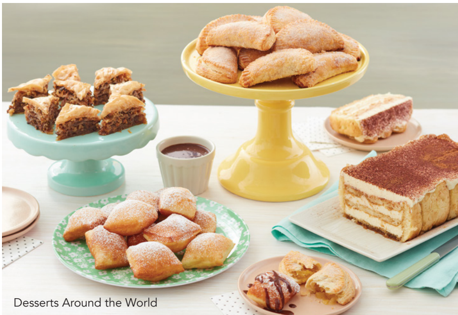
Desserts Around the World