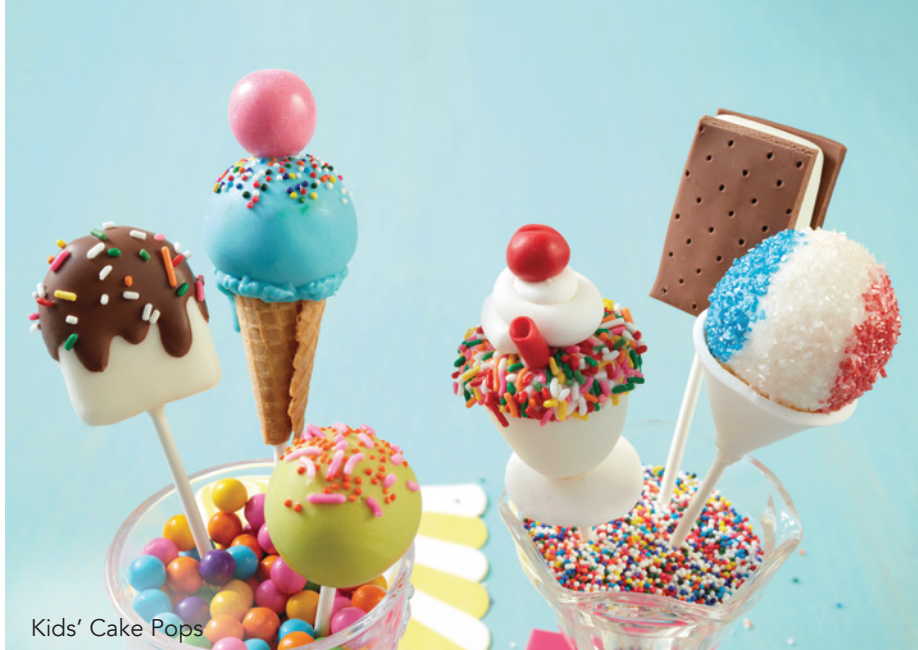
Kids' Cake Pops