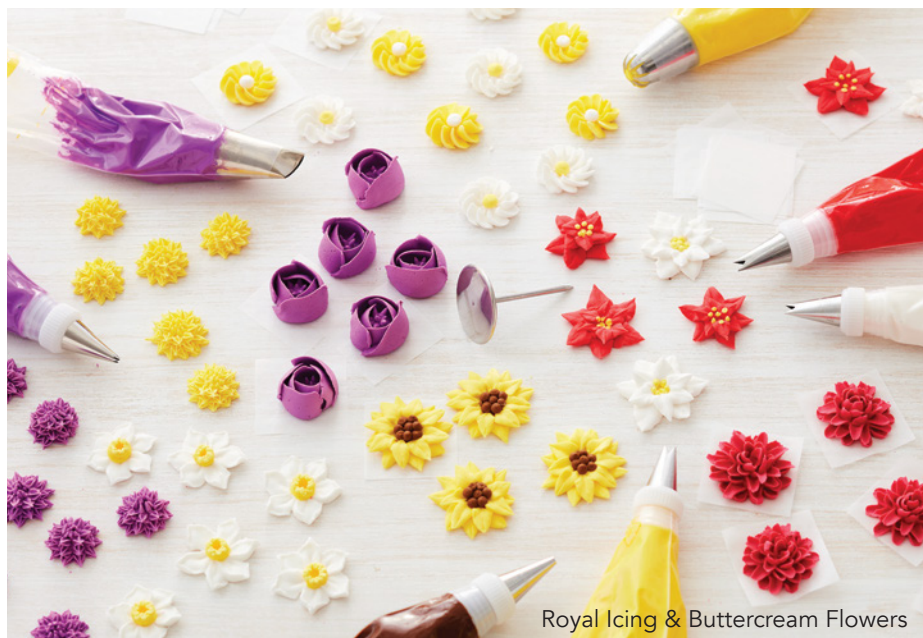
Royal Icing & Buttercream Flowers