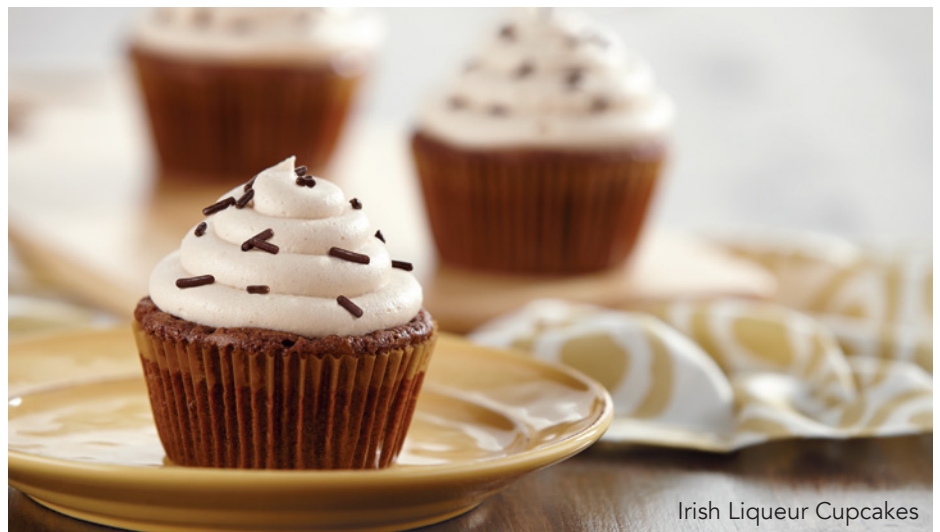
Irish Liqueur Cupcakes