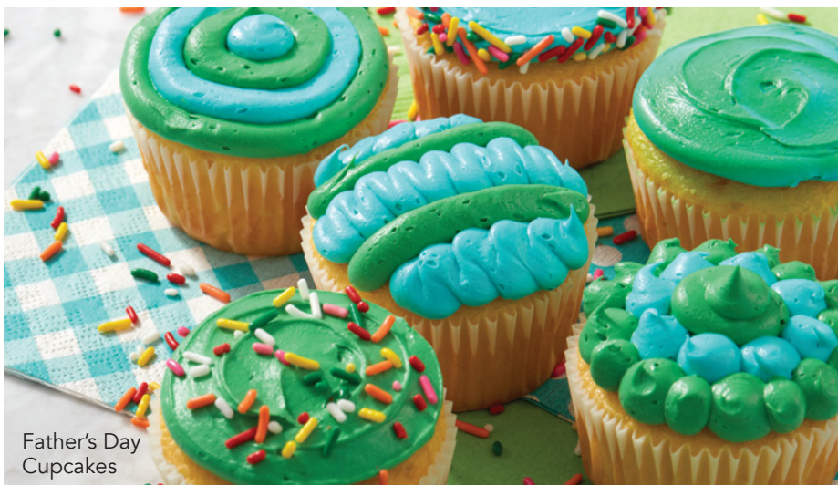
Father's Day Cupcakes

MOTHER'S DAY: (2 Sessions) Cupcake Decorating May 7, 10 am – 12 pm; 1 – 3 pm