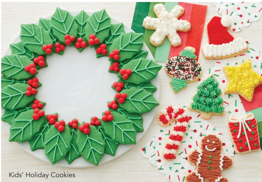
Kids' Holiday Cookies