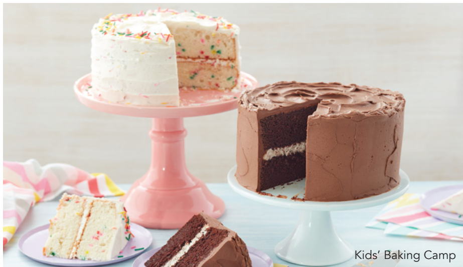
Kids' Baking Camp