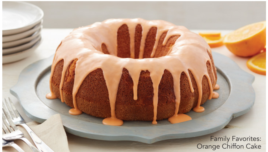
Family Favorites: Orange Chiffon Cake