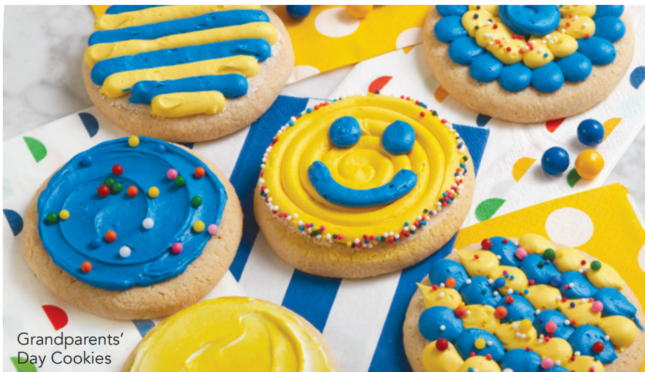
Grandparents' Day Cookies

CHRISTMAS COOKIES: (2 Sessions) December 18, 10 am – 12 pm; 1 – 3 pm