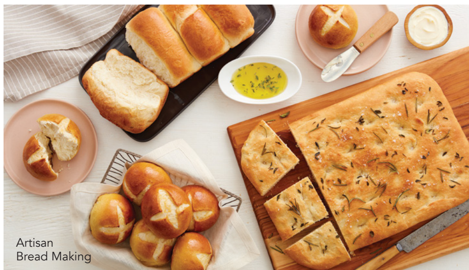
Artisan Bread Making

Everyone loves to bake and taste the end result! Beginners and experienced bakers alike will learn new baking tricks and techniques from our professional pastry chefs for making cakes, breads, pastries and more with our many different baking classes. No experience needed to join in the fun!