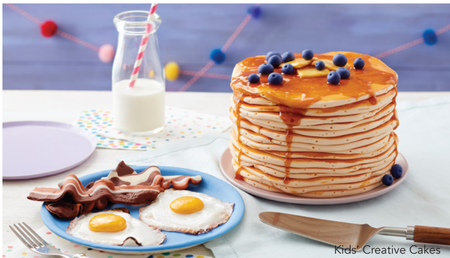
Kids' Creative Cakes