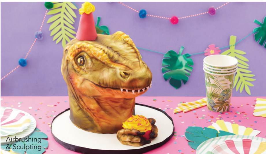
Airbrushing & Sculpting