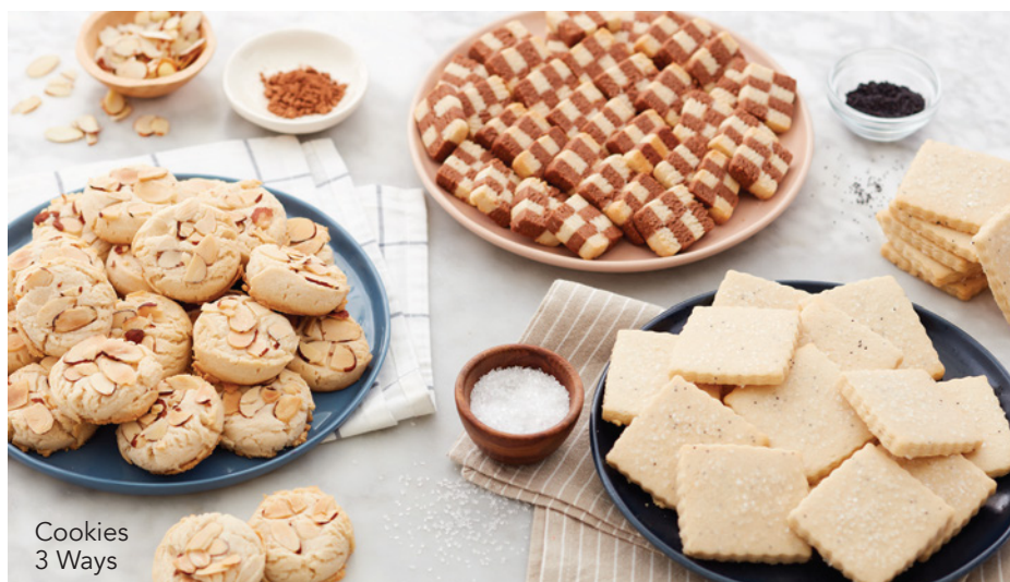
Cookies 3 Ways