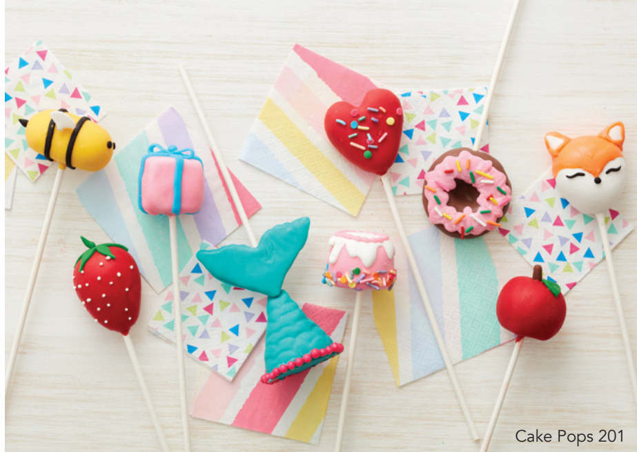
Cake Pops 201